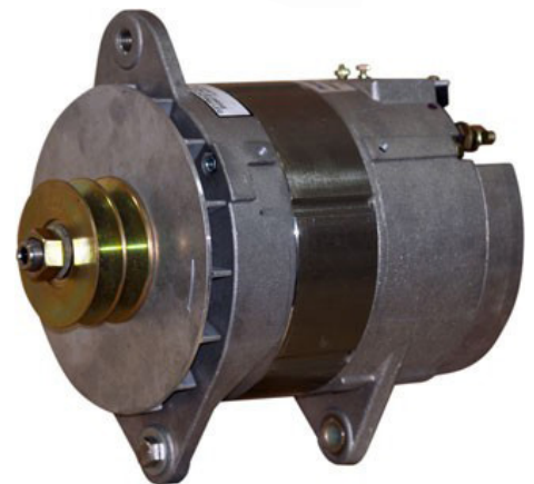
97EHD-Series 190A, 24V Model