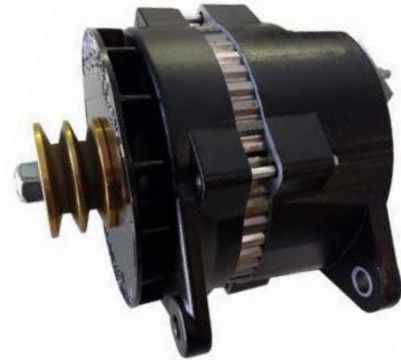
97EHD-Series 85A & 110A, 24V

Contact Balmar Tech Service to learn more about the 97EHD-Series Alternators!